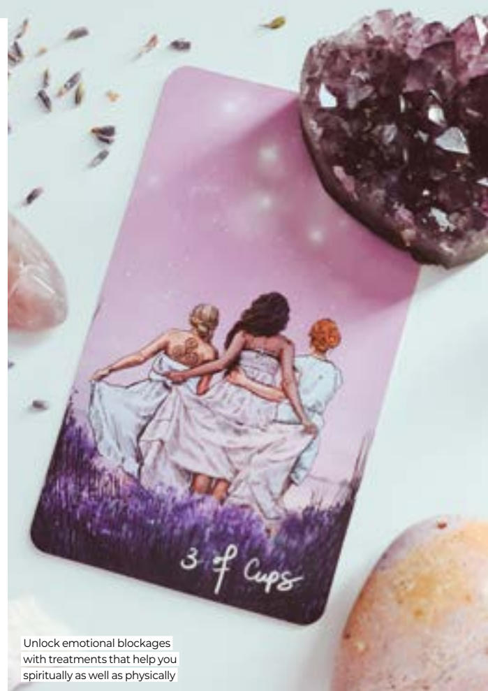
Unlock emotional blockages with treatments that help you spiritually as well as physically

S pirituality and formerly arcane practices have gone mainstream, with CEOs, lawyers and HNWs seeking help from tarot readers to people 'in spirit' to make those big decisions. Yes, hedgies to bankers – and at least one newspaper proprietor – have become 'seekers'. The pandemic and financial crisis were the catalyst, but colour healing, bodywork and crystals – once the domain of hippies and New Agers – are now sought by masters of the universe types wanting self-knowledge and clarity on their personal lives, careers and next steps. Here are the therapists, gurus and guides helping these folk release their trauma, access a greater wisdom, and transform themselves. Their mantra is that you can't change our turbulent world, but you can become the change you want to see.