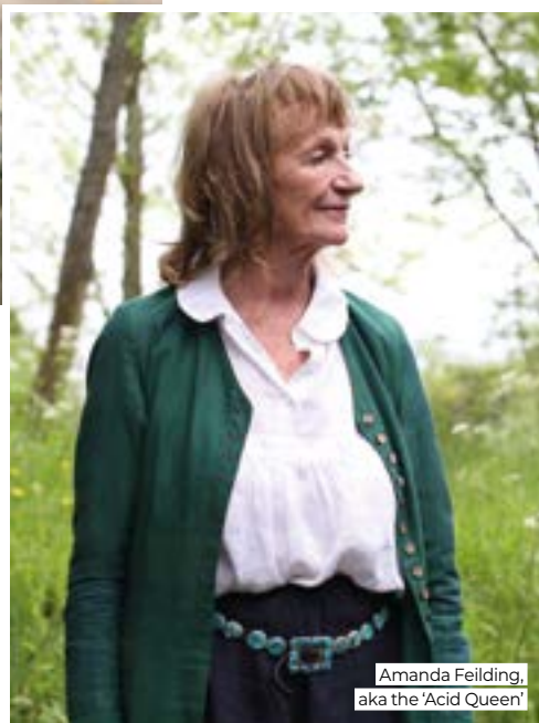
Amanda Feilding, aka the 'Acid Queen'

BOOK IT: Beckley Retreats in the Netherlands now run for five nights, costing from €5,500 (shared room) with a maximum of 20 participants. The price includes vegetarian meals. beckleyretreats.com